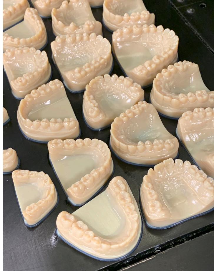
Completed 3D print with Separator DM

In addition to saving time, the easy separation also helps NEO to increase accuracy. For example, a tech would struggle when prying the acrylic up on a retainer using standard separator. And the wires might have flared up, which would then need to be bent back to the original shape. But with Separator DM, the acrylic easily pops off the model, so the wires stay in place leaving the device highly accurate.